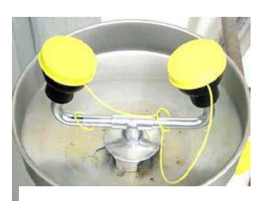
Figure 3. Emergency Eyewash Unit

Devices which contain its own flushing liquid must be replaced or refilled after use and maintained according to manufacturer's instructions. It should contain enough fluid for 15 minutes of continuous flow. Contact EHS to replenish any fluid lost in the test and replace any fluid which is beyond its expiration date. (Figure 6)