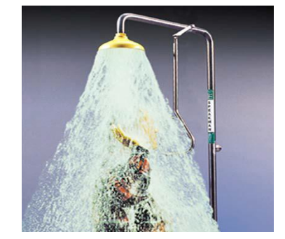
Figure 1. Emergency Shower