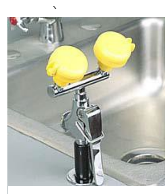
Figure 5. Hand held drench hose